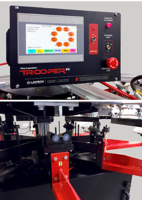
Registration Lock w/ Ball Bearings