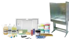
ECONO-PRO Washout Booth