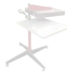
SEE COMBO UNIT BELOW