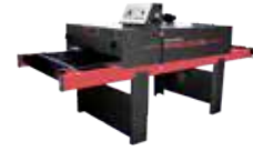
ENCORE #3610 230 Volts; 1-Phase 36" Belt Width; 10' Long