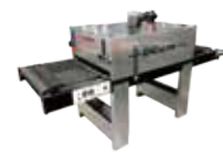
ENCORE #2408-2 230 Volts; 1-Phase 24" Belt Width; 8' Long