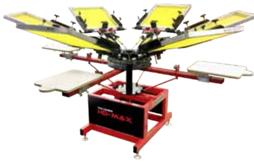
HD-MAX Kit 6-Color; 4-Station Floor Model Kit Pre-Assembly Available