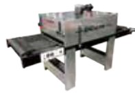
ENCORE #2408-2 230 Volts; 1-Phase 24" Belt Width; 8' Long