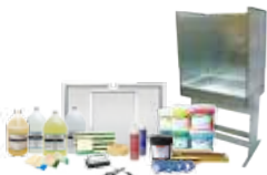
ECONO-PRO Washout Booth