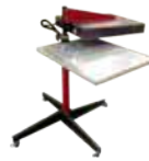
FLASH/DRYER COMBO UNIT Econo 16" x 16"