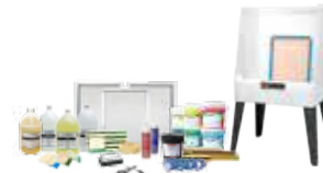
POLY-PRO #3848 Washout Booth