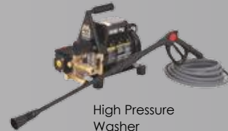
High Pressure Washer