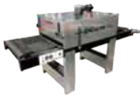
ENCORE #2408-2 230 Volts; 1-Phase 24" Belt Width; 8' Long