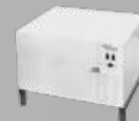
Pro-Cure Screen Dryer