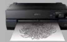
Epson P800 InkJet Printer for Film Positives