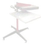
SEE COMBO UNIT BELOW