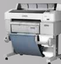
Epson T3270 InkJet Printer for Film Positives